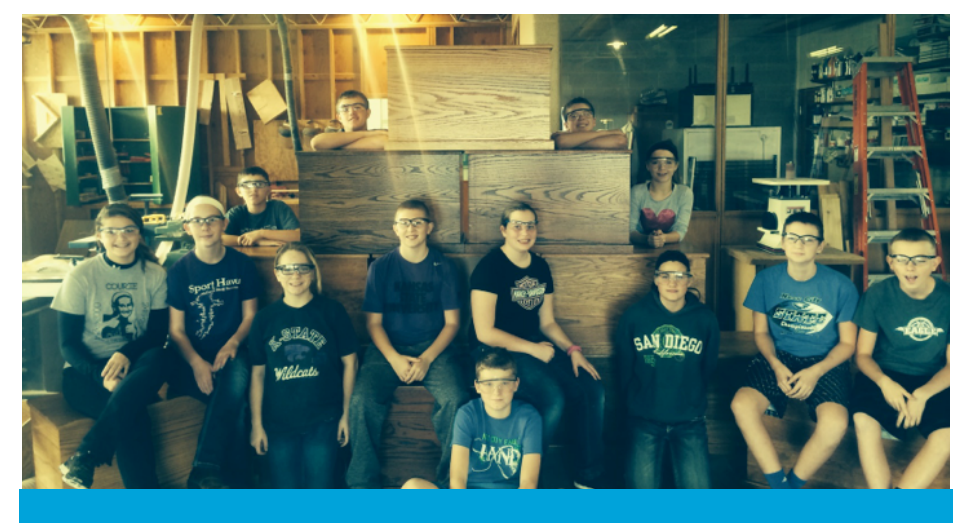
First Semester 8th Grade Woods Class with their Cedar Chests!