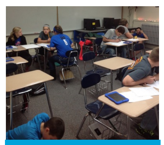
7th Grade Students work on their Countries project.