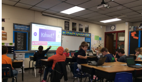
Using Kahoot as a review game