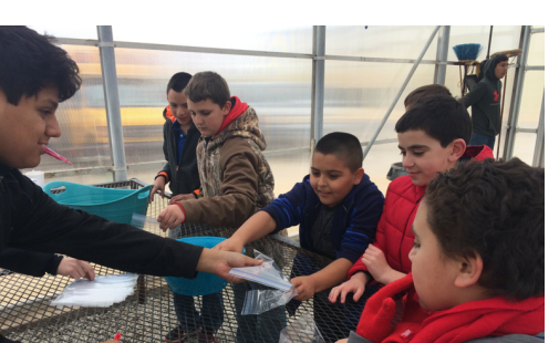
A group of 4th grade boys during our FFA day

learn. To start of the year one of the first things that we were able to attend was the Ag. Safety day in Jetmore. This had many stations that taught the students about several different things that