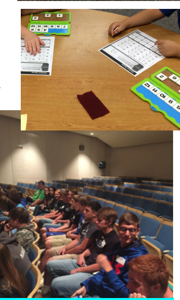
StuCo members waiting for the conference to start