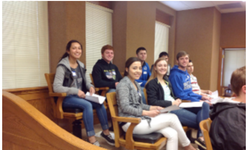
Several members of the Government class were selected to view the court proceedings during County Government Day