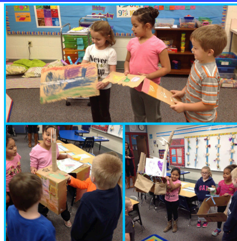
“The Box Project” – Each group designed and created an object out of a box. Groups created: a TV with remotes, a cat and cat house, a coo-coo clock, a house, a rocket, and an helicopter