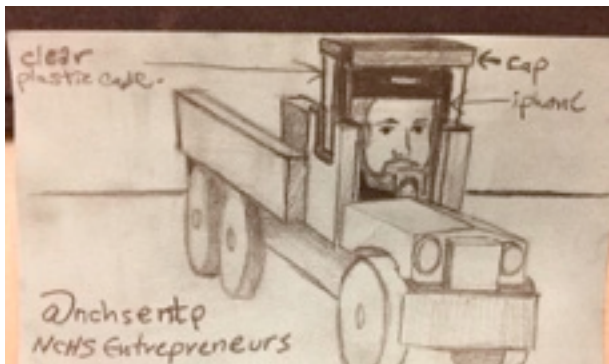
The Talk-N-Toy will let traveling people teleconference with babies and toddlers!