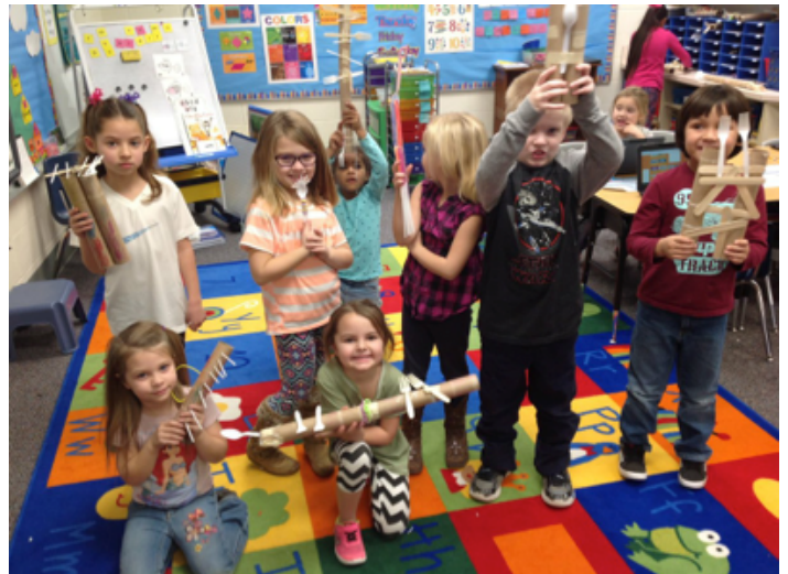
“Big Smelly Bear” – Student designed and created back scratchers.