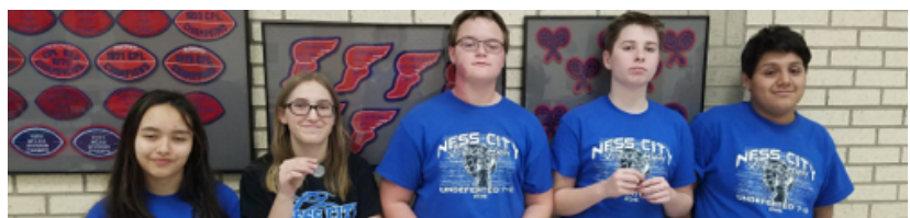
2nd Place JH CPL Scholars Bowl Team

Along with our excitement for Banquet, members are preparing for State Contests. The members have been putting many long hours in all year to prepare for state contests at the beginning of April. We have four teams competing, including a Floriculture team, Agriculture Communications team, Food Science team and an Entomology team. These teams did very well at their district contest, placing third or better. The students going to state include;