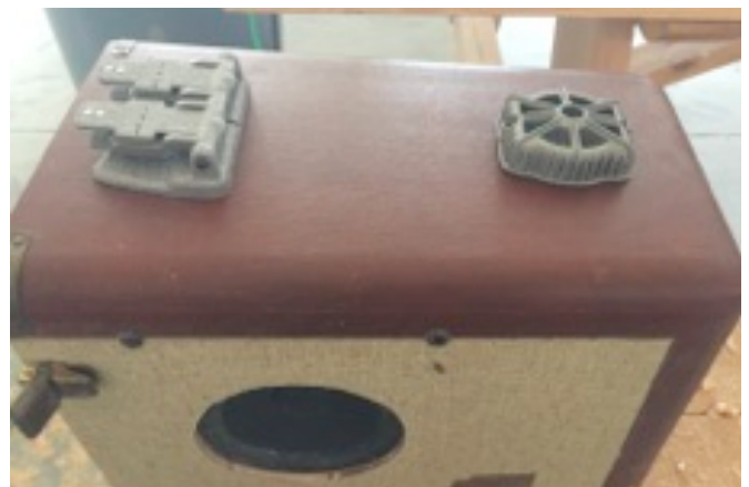
Who do I trust to build an amplifier for the coolest steampunk guitar on the planet? The inventors and entrepreneurs from Ness City of course. They are retrofitting an antique 8mm film projector and case and turning it into an amplifier complete with radio vacuum tubes and steam pipes and valves.