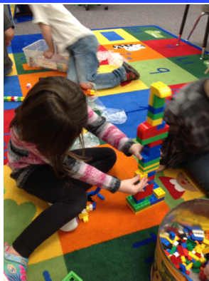
“If I Build a House” – Created a house from different materials.