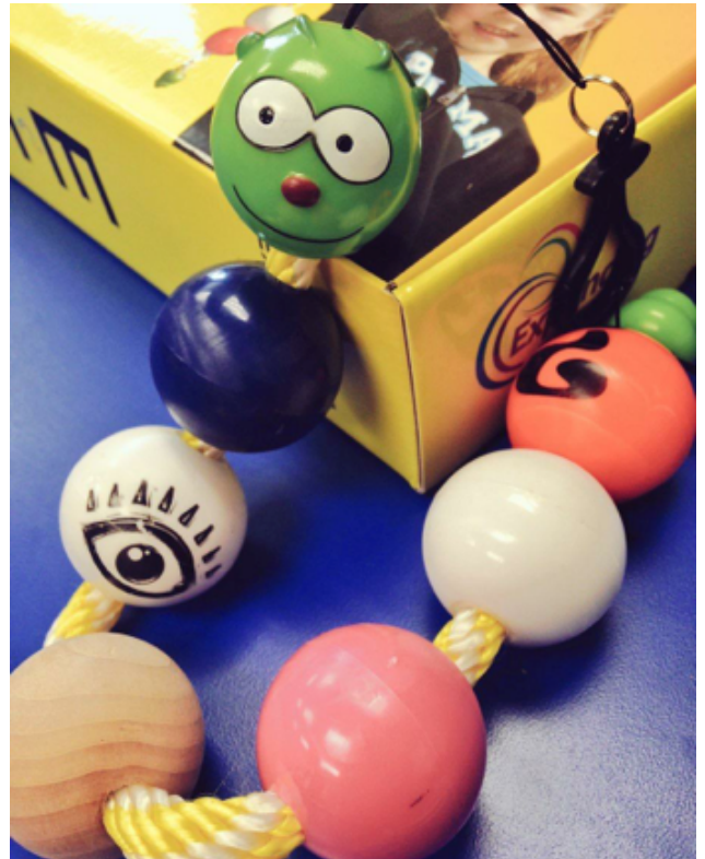
Eechy the Inchworm

My students have gone from writing phrases and just a handful of sentences about a topic to writing full paragraphs using the EET. Now that they are familiar with the process, I am excited to see how much farther out of our writing comfort zone we can go next year.