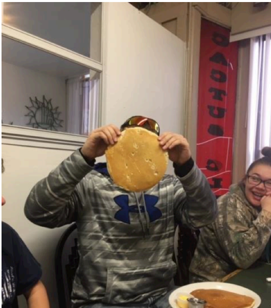
Seniors enjoying the feast portion of the Canterbury Tales!

Seniors picked up where we left off at the end of the first semester -- in the midst of The Canterbury Tales . After a close study of two pilgrims' narratives, students composed their own original tales in small groups. Though the writing assignment was challenging, students rose to the occasion and had some thrilling original stories to share with the whole group as we trekked to The Cactus Club for breakfast one morning on our own "pilgrimage." The group unanimously agreed: the several weeks of writing was worth the delicious breakfast burritos and biscuits and gravy!